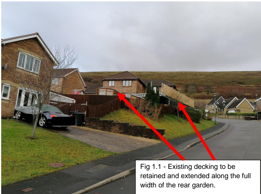
Fig 1.1 - Existing decking to be retained and extended along the full width of the rear garden.

1.5 Raised Upvc decking has been constructed parallel to the southern boundary (fronting Tanglewood Drive), behind and elevated above the existing fence enclosure. The decking has been constructed on a steel frame at an approximate height of 2.3m with a further 1.2m high timber fence sat above that. The overall height from ground level is 3.5m high, or 5.1m from footpath level. The existing decking is approximately 13.5m long x 4.5m wide at its widest point.