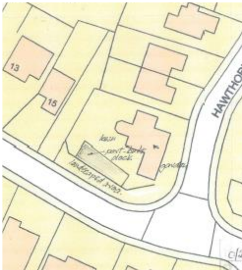
Fig 1.2 - Extent of decking already constructed proposed 'to be retained'.

1.6 In addition to the retention of the raised decking to the south, this application seeks to extend the unauthorised decking, returning it along the full length of the rear (western) boundary for a length of 17m x 6.5m wide (at its widest point). In effect, the resultant decking will wrap around the garden in an 'L' shape.