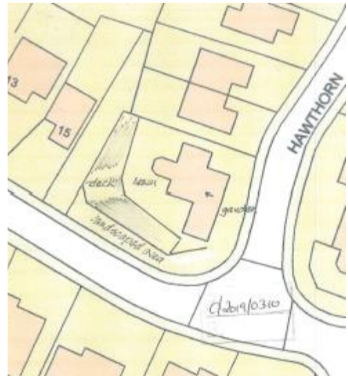
Fig 1.3 - Proposed decking applied for.

1.7 No additional landscaping has been proposed along the southern landscape verge.