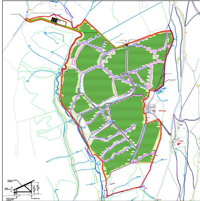
Figure 1 – General Site Layout

of the site and a new access track will be created off the B4256 at the north west corner of the site. The latter access track, which falls within the County Borough of Caerphilly, will be used for the construction and decommissioning of the site.